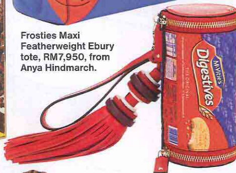
Digestives Clutch, RM5,350, from Anya Hindmarch.