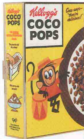
Coco Pops Imperial Clutch, RM5,890, from Anya Hindmarch.

You may have noticed food-inspired designer wear as of late (Moschino's McDonald's bag and Chanel's grocery store runway at Paris Fashion Week, anyone?). Anya Hindmarch's Counter Culture collection echoes this trend by juxtaposing the humour found in everyday items with luxury. Fun designs like cereal boxes and Digestives biscuits fashioned into totes and clutches make this Fall/Winter 2014 collection one to crave, literally.