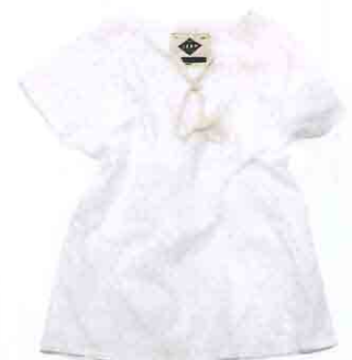
Blouse, RM129.90, from Jeep.

Staple pieces mean easy ensembles - just the way we like it. Check out Jeep's new Carefree Tripper collection, with comfortable, practical pieces that are made for days off or even for travelling! Our picks include their go-to white blouse and super cute denim shorts.