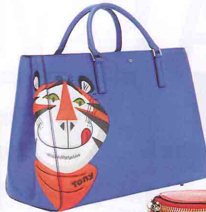
Frosties Maxi Featherweight Ebury tote, RM7,950, from Anya Hindmarch.