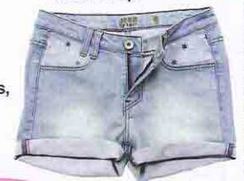
Denim shorts, RM139.90, from Jeep.