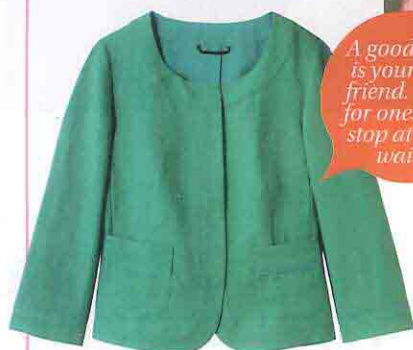
IF YOU'RE PETITE... Jacket, from Max Mara.

A good crop is your best friend. Look for ones that stop at your waist.